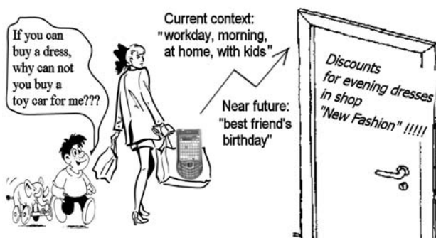
Figure 1 Scenario to avoid for a recommender system.

One way to solve this problem would be to let users to mark some information as “private”, but it would require an extra effort, and users can forget to do it. There can be also certain predefined categories of private topics (e.g., adult videos should not be accessed by children). However, even if the topic of somebody’s interest is not really a secret, anyway it is often beneficial to avoid public announcement of it. For example, every child knows that his/ her mother sometimes buys new clothes, and usually has nothing against – with the exception of cases when an advertisement of a nice dress comes just after the child was refused to buy a new computer game or a toy. Thus, we propose that recommender systems should consider all information as private by default.